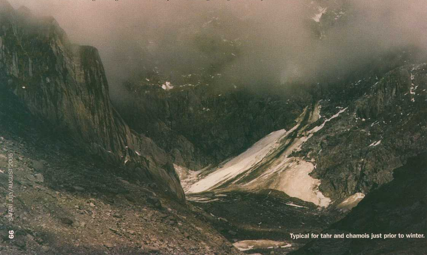
Typical for tahr and chamois just prior to winter.