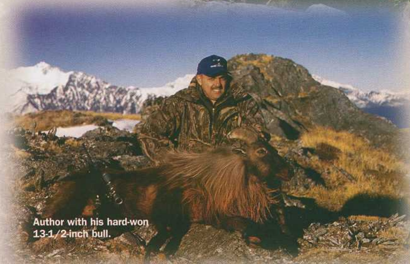
Author with his hard-won 13-1/2-inch bull.