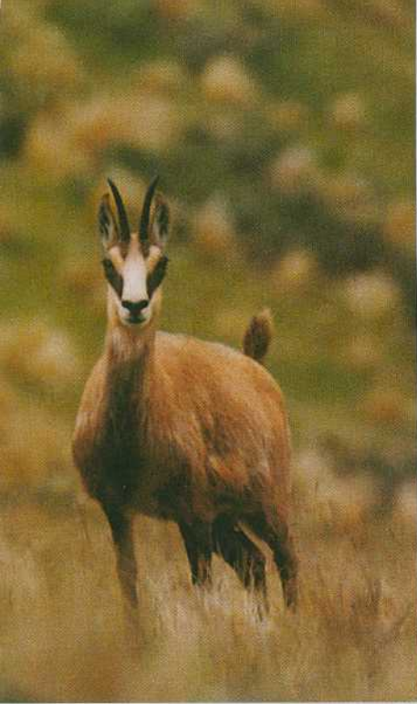
A female chamois in summer coat. Males and females have hooked horns, but the males have much heavier bases.

bluff systems ahead were a breathtaking spectacle that included snow-capped crags reaching into the clouds. The higher we climbed, the steeper, rockier and more barren the terrain became. The chamois, though, seem to like it just fine in these surroundings. I suppose they feel more secure at high altitude, and they always seem to look down for danger, never up.