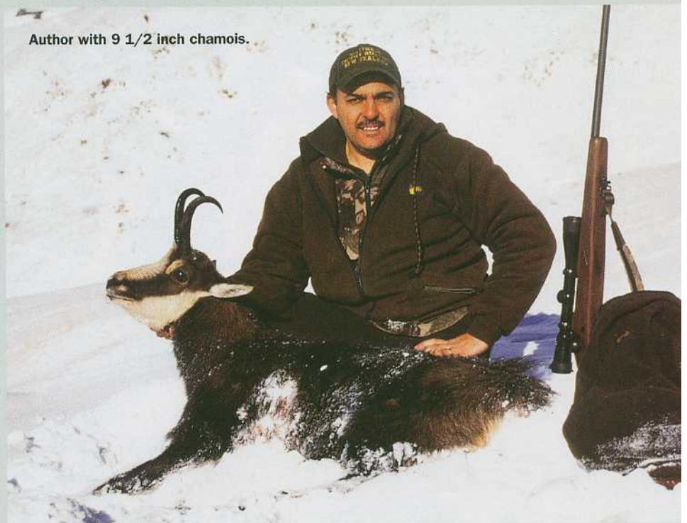
Author with 9 1/2 inch chamois.