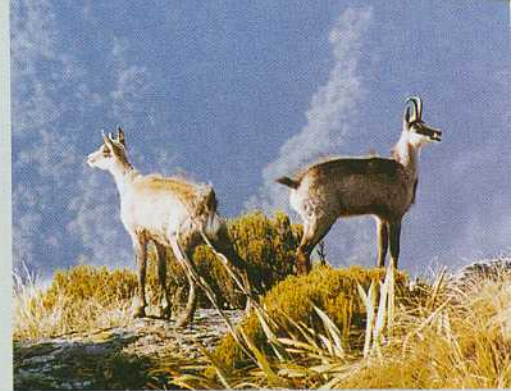
A female chamois and her kid in summer coat.

We packed up and began backtracking, moving as hastily as possible